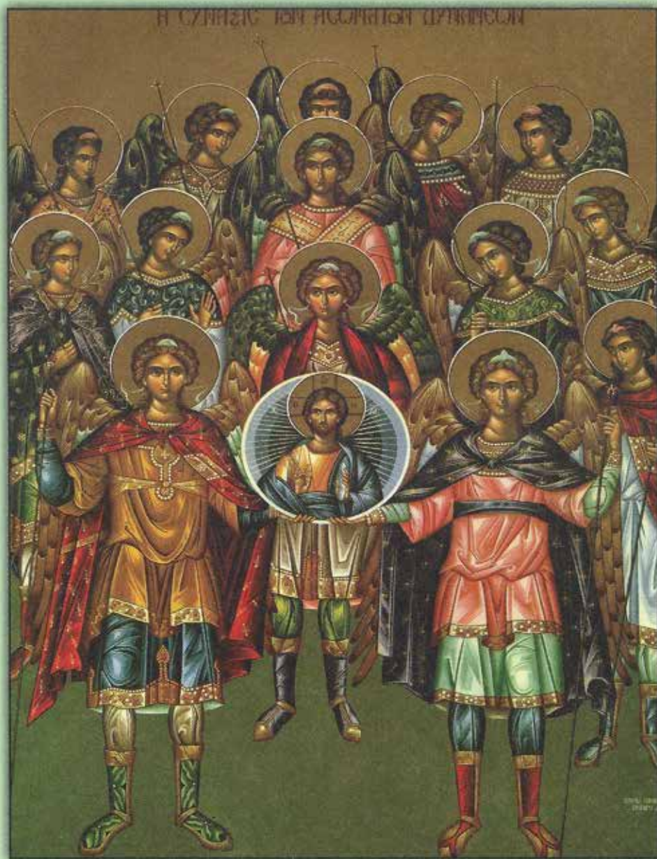
Icon of Saint Michael and all the Angels — November 8th