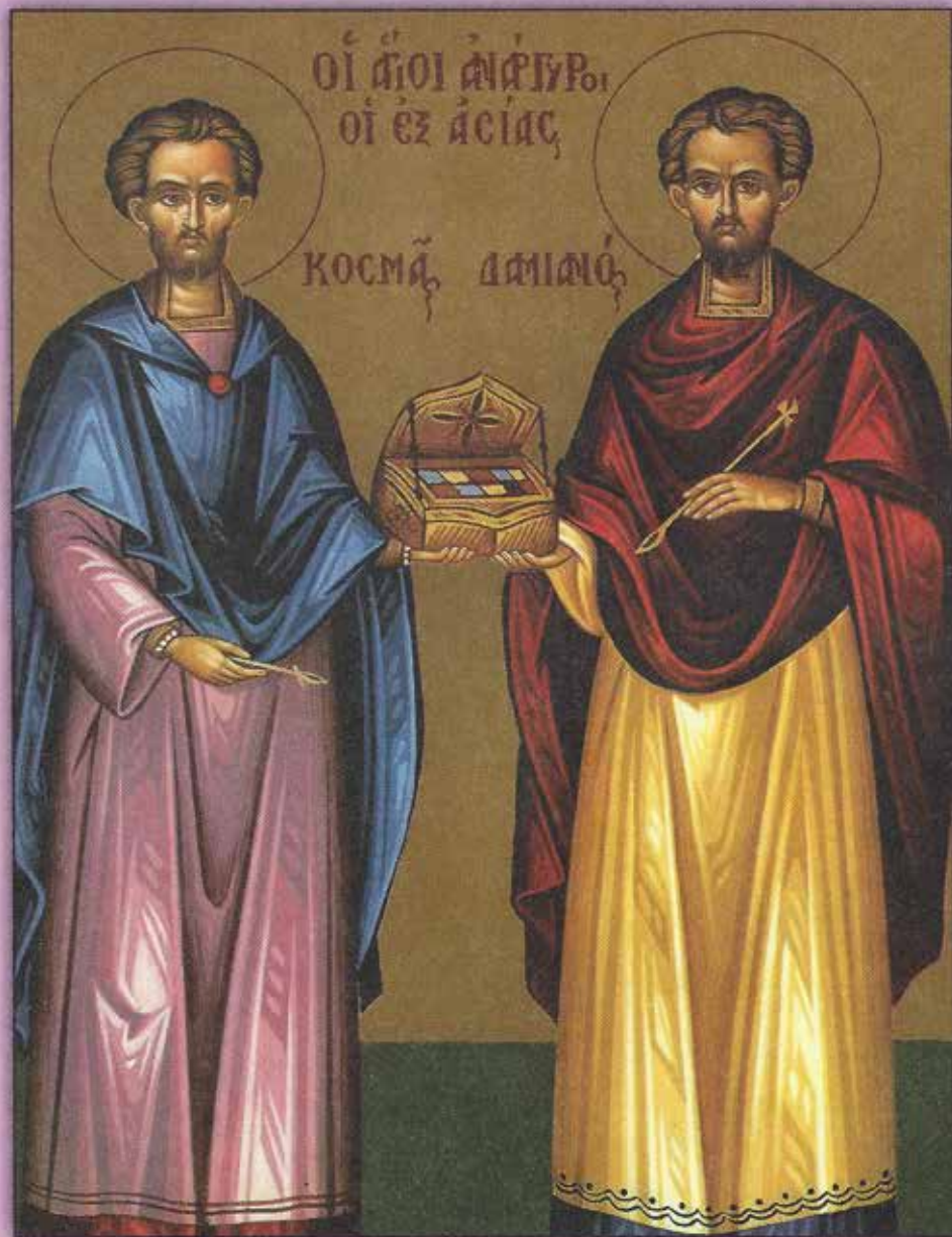
Icon of Saints Cosmas and Damian -- November 1st