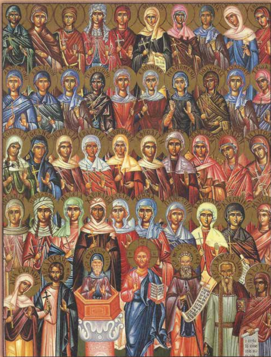
Icon of the 40 Women of Macedonia and Ammon -- September 1st