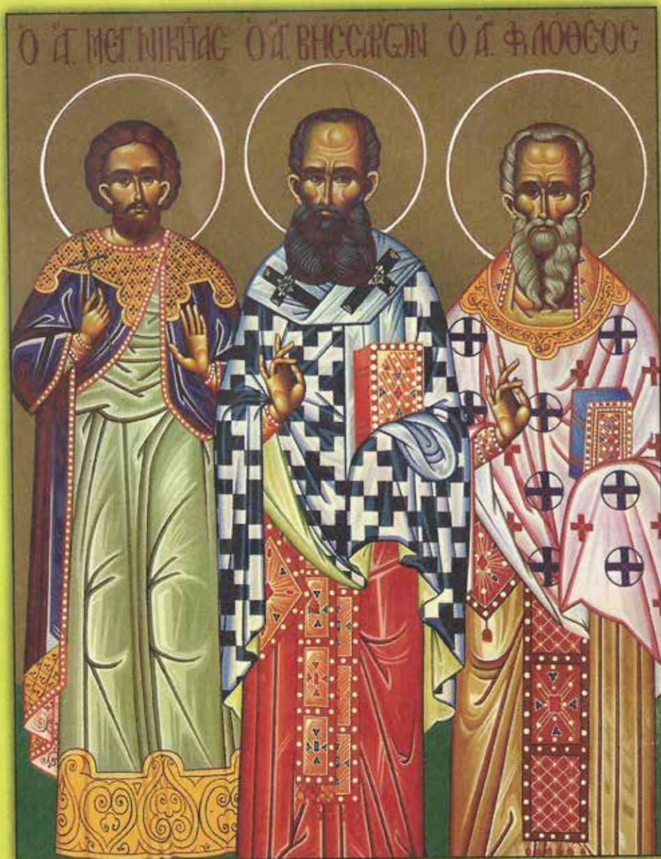
Icon of Saints Nikitas, Bessarion and Philotheos — September 15h