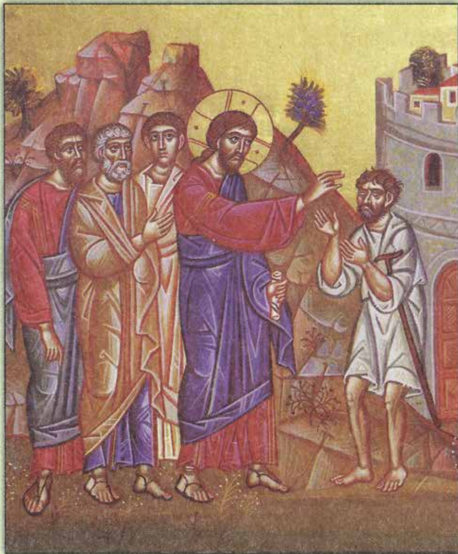
Icon of Jesus Healing a Blind Beggar - Luke 18:35-43