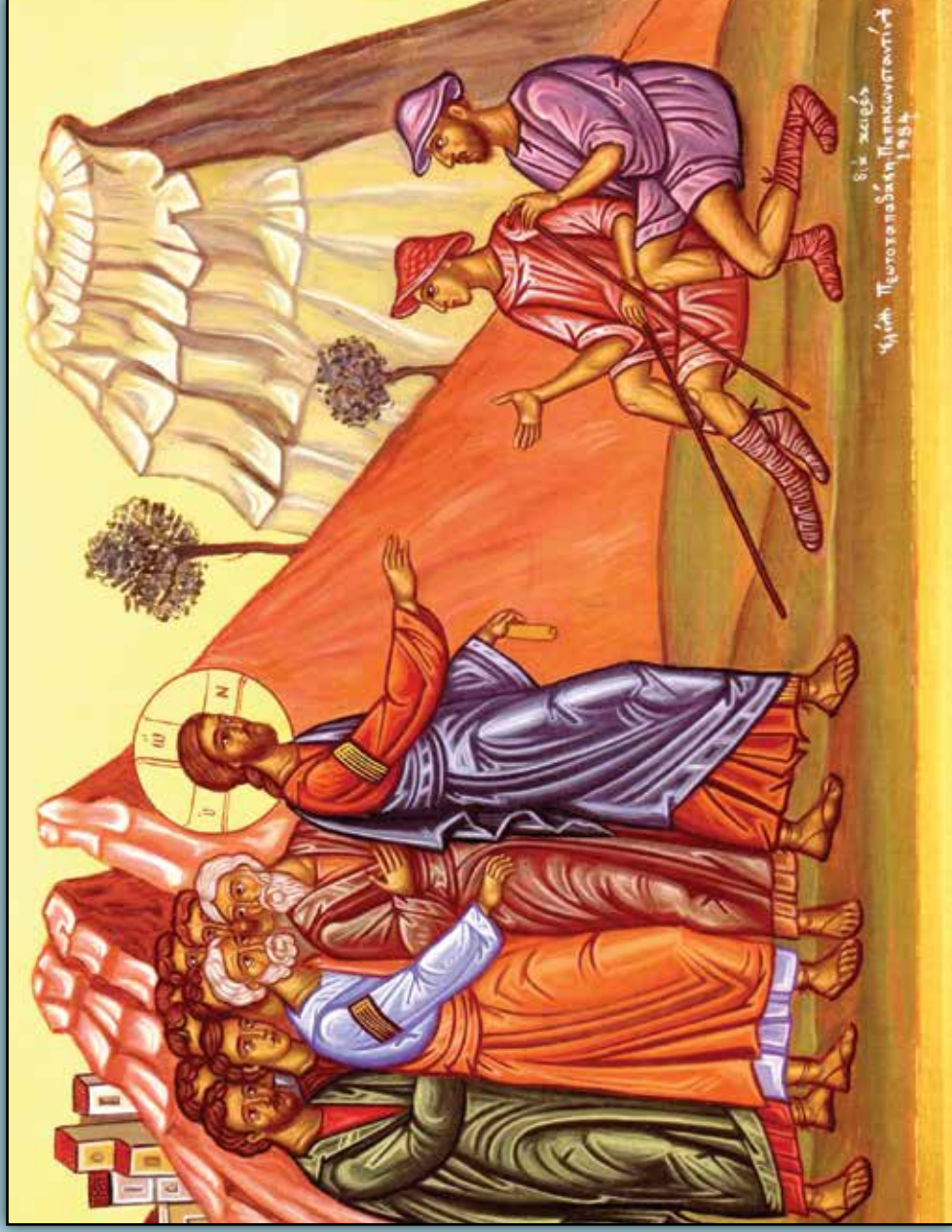
Icon of Healing Two Blind Men