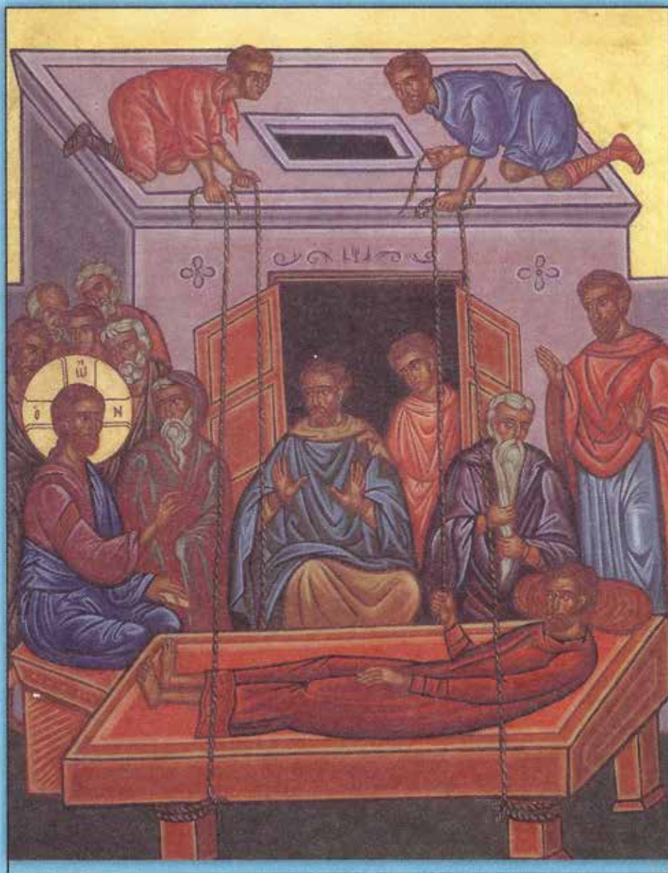
Icon of the Paralytic Lowered through the Roof