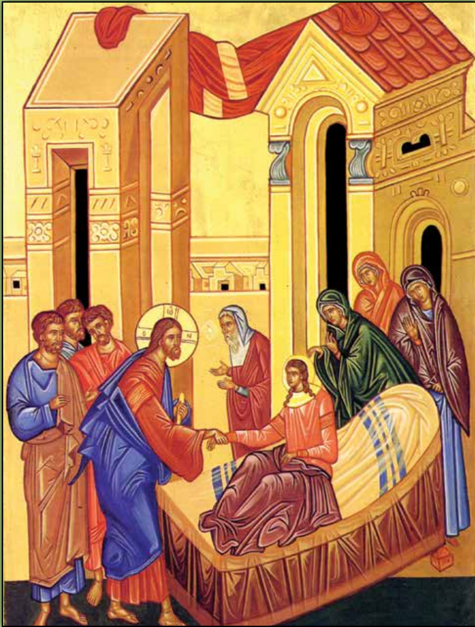
Icon of Healing Jairus' Daughter (Luke 8:41-56)