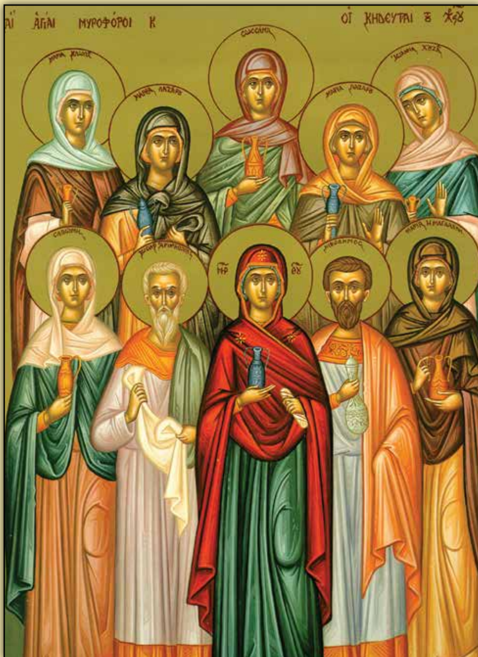
Icon of the Myrrh-bearing Women