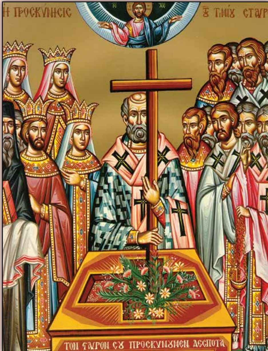
Icon of the Sunday of the Holy Cross