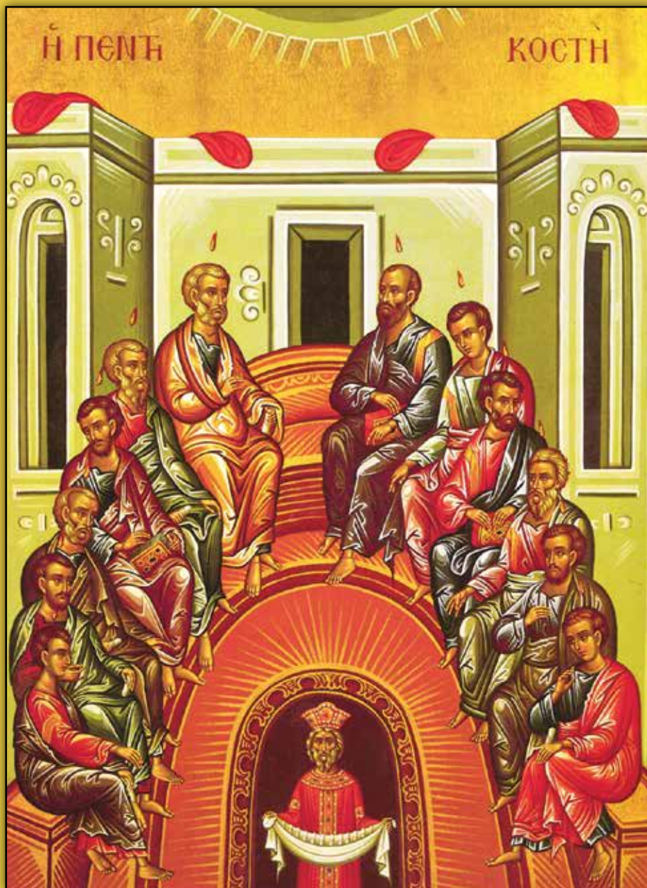
Icon of Pentecost