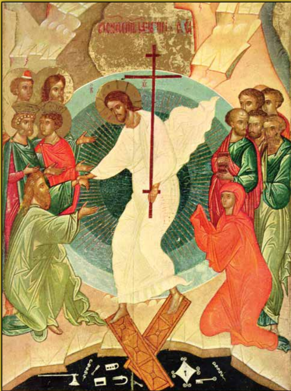
Icon of the Resurrection