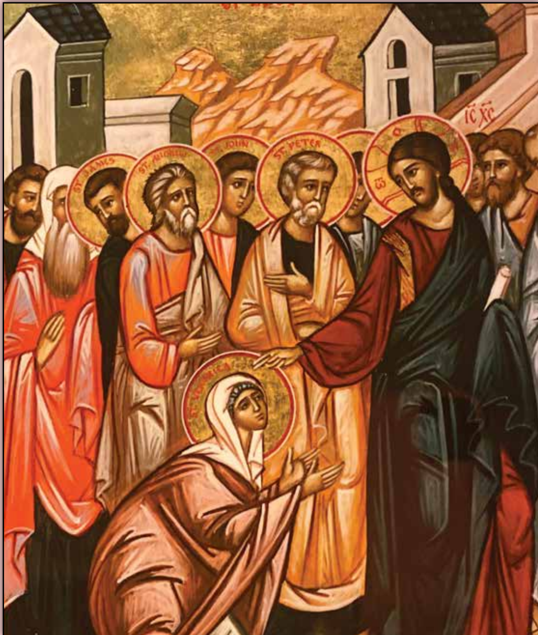
Icon of the Canaanite Woman (Matthew 15:21-29)