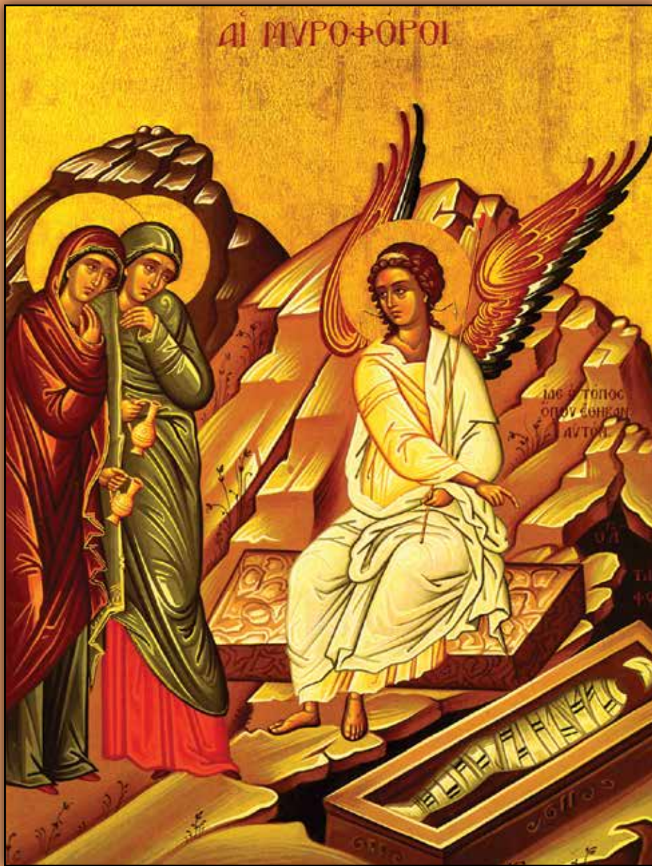
Icon of the Myrrh-bearing Women