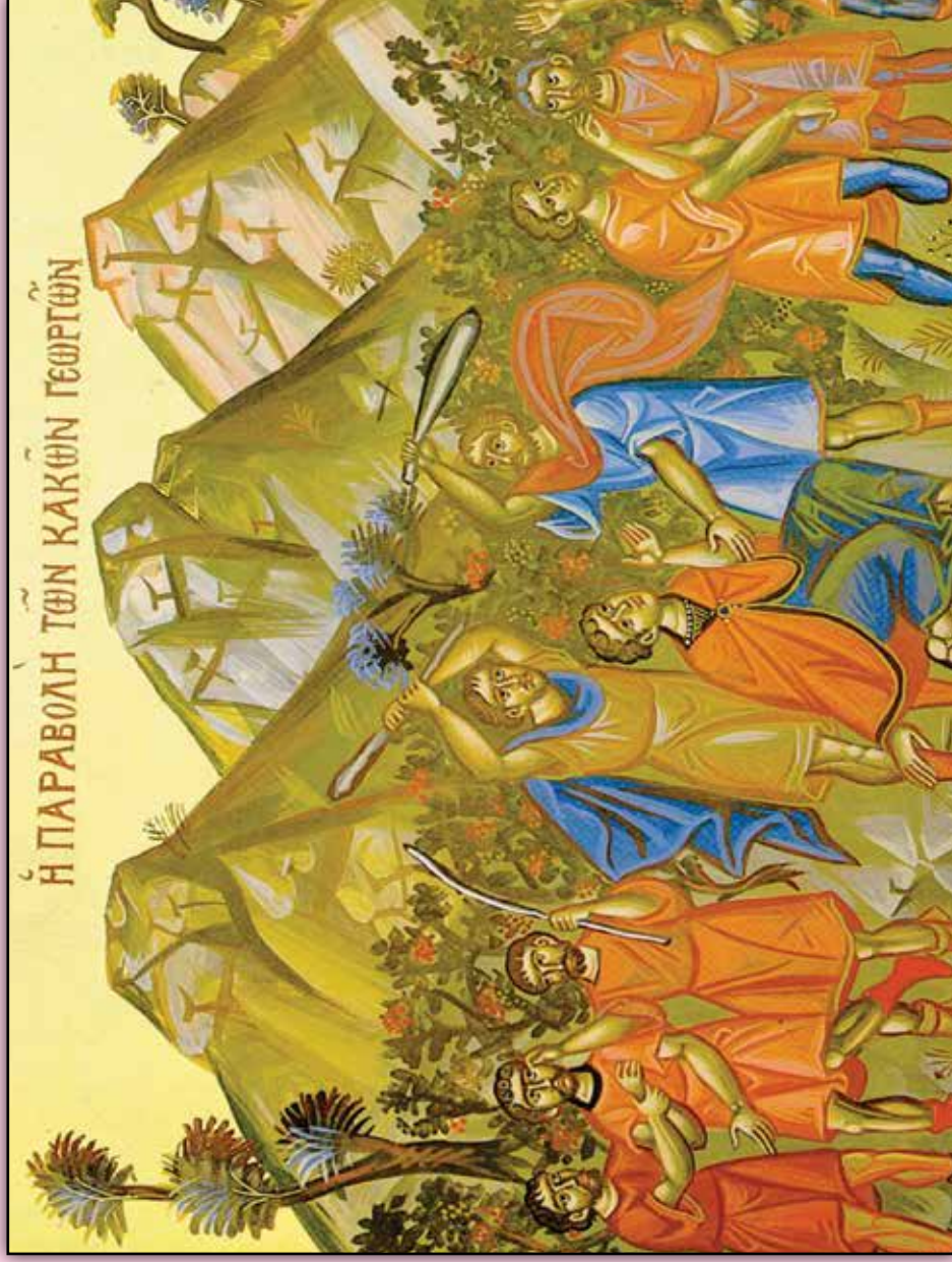
Icon of the Tenants Farmers (Matthew 21:33-42)