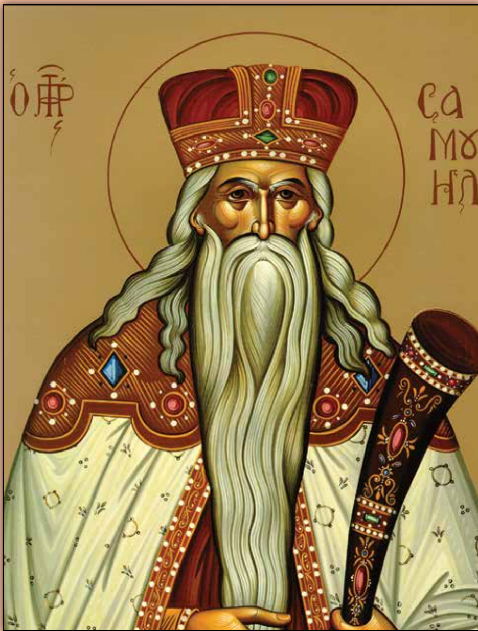
Icon of the Prophet Samuel -- August 20th