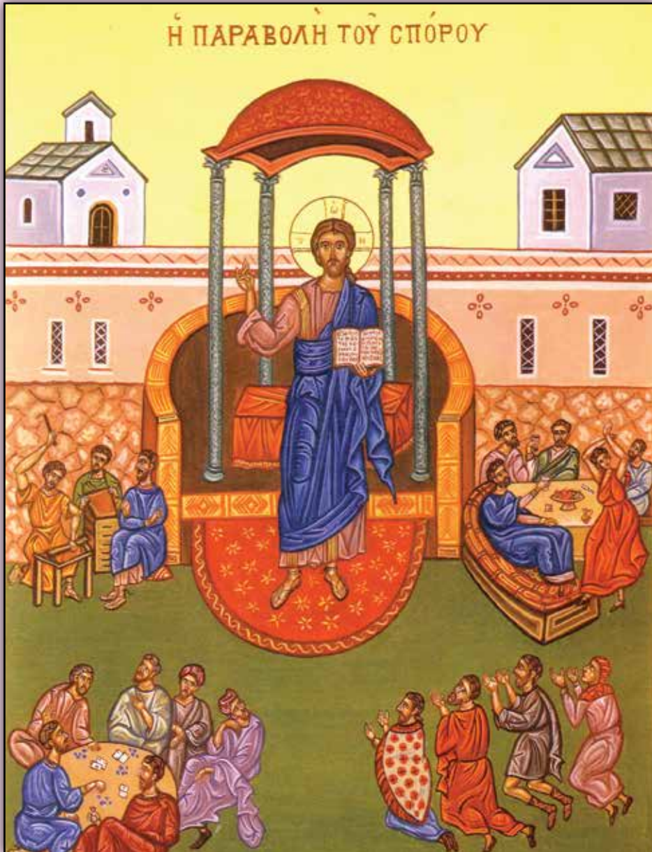
Icon of Parable of the Sower and Seed