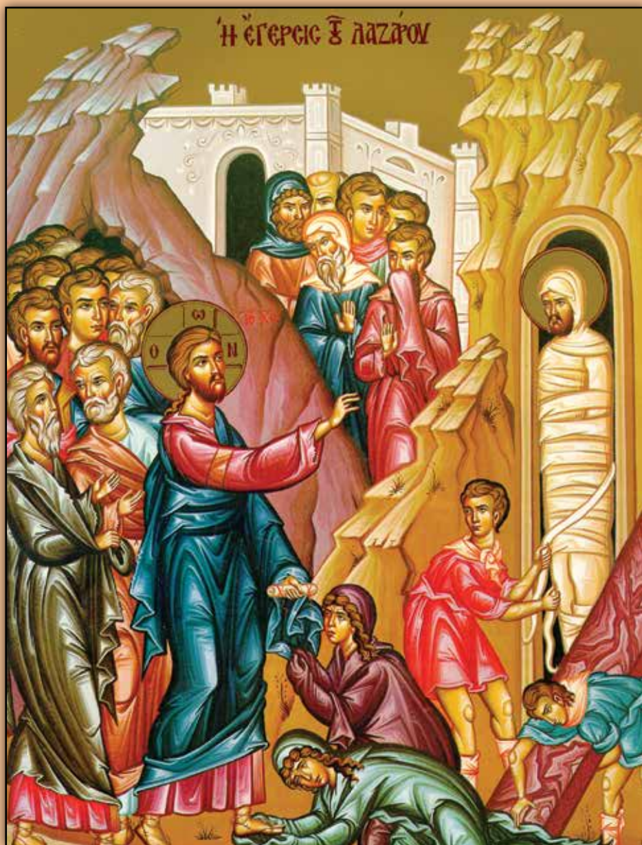
Icon of Raising Lazarus from the Dead