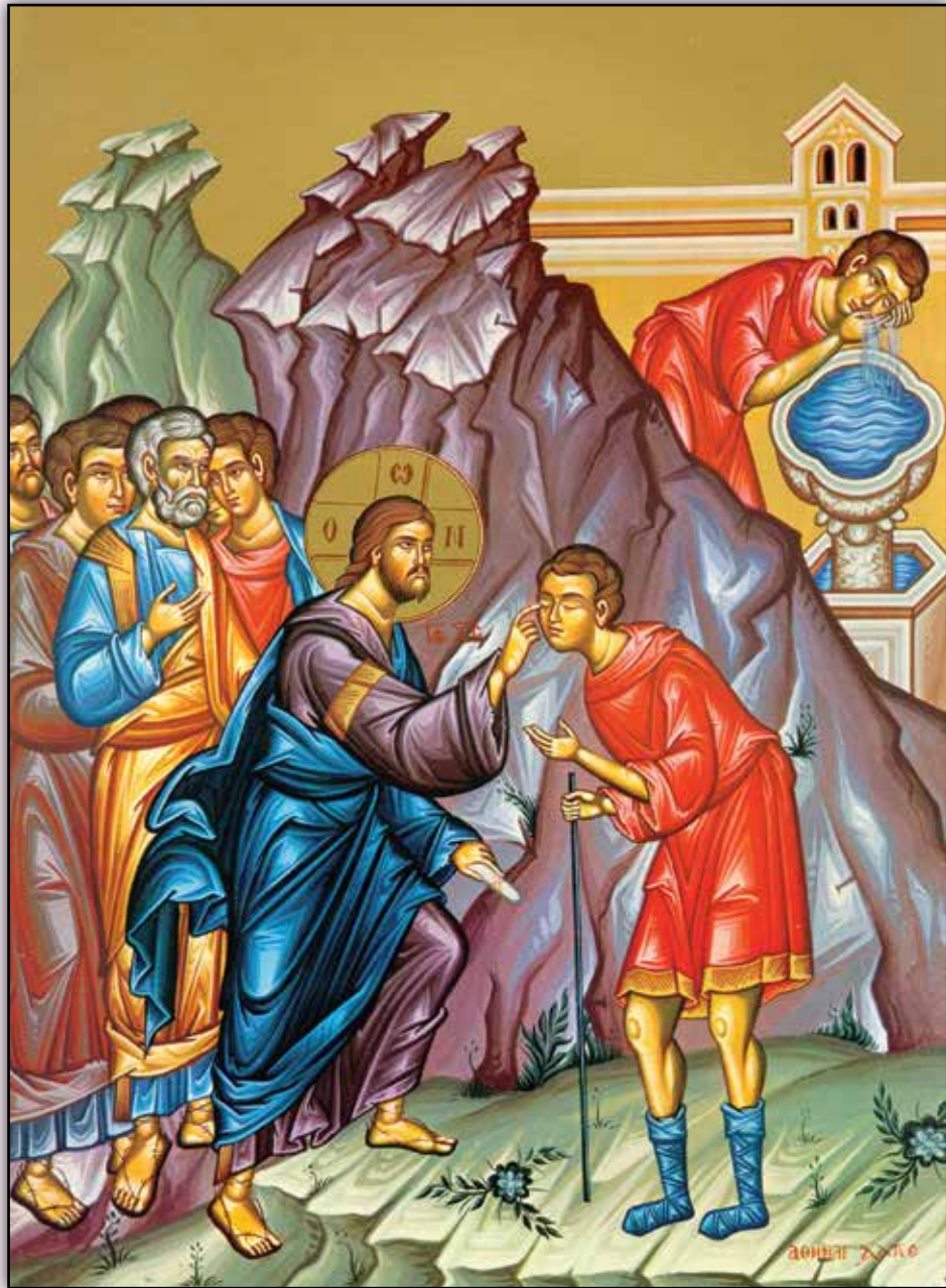
Icon of the Gospel of the Man Born Blind