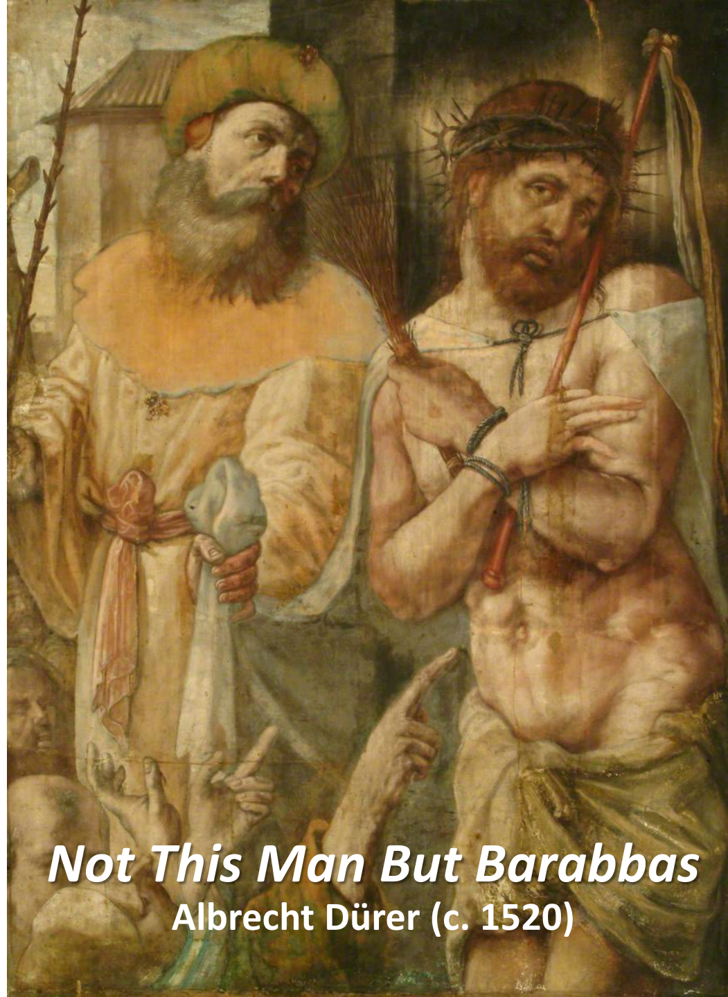
Not This Man But Barabbas Albrecht Dürer (c. 1520)