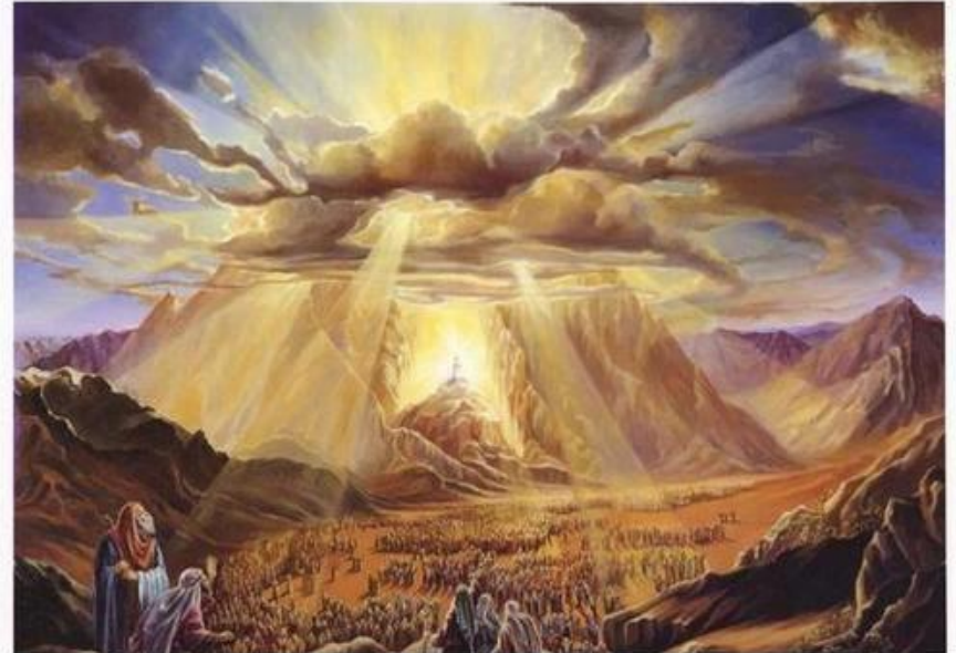
Pentecost (the gift of the Law)