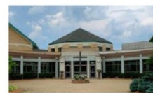
St. Margaret of York, Loveland, Ohio