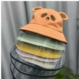
This fisherman hat with face shield can be found on several websites and in many different animals/characters.