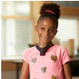
This is the child version. Zverse.com. These can only be preordered at this time.