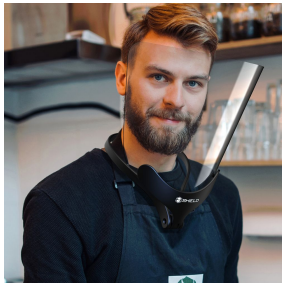
Teachers in Preschool/Pre-K will be wearing these.