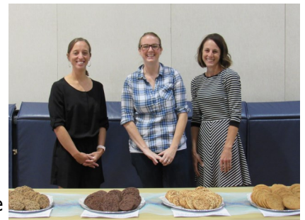
Thank you to our parent servers