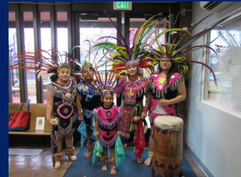
Danza Azteca Quetzalcoatl dancing to honor Our Lady