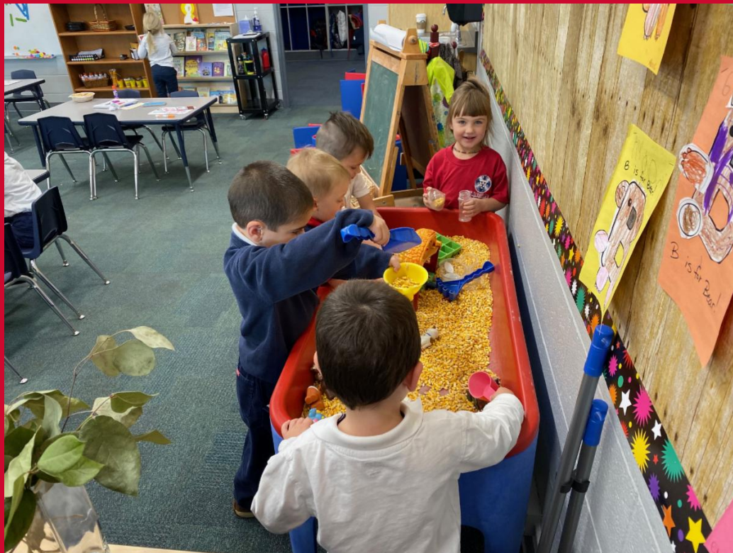
Sensory learning by our Preschoolers