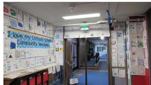
"I am Thankful for my Catholic School Community because..." Coloring Contest