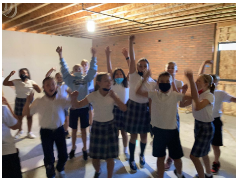
Excitement the first time our 5th graders got to see their future classroom during construction

Thank you, St. Mark's, for your support of our parish school and the journey we've been on. Please stay tuned for an exciting announcement regarding our school in the coming weeks! We are SO excited to travel together on our journey towards revitalization.