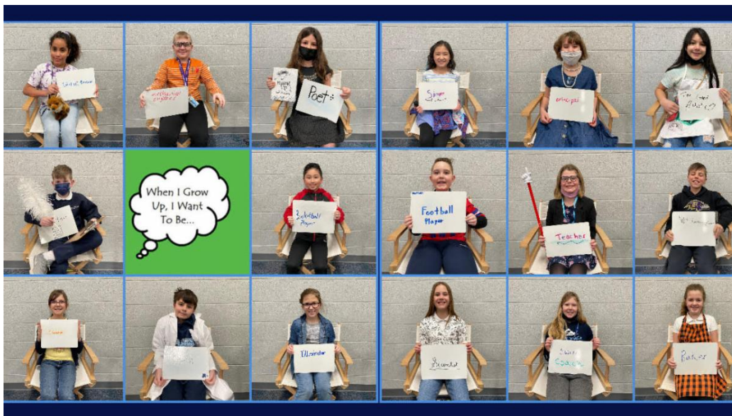
Tuesday was "What I Want to be When I Grow Up" day