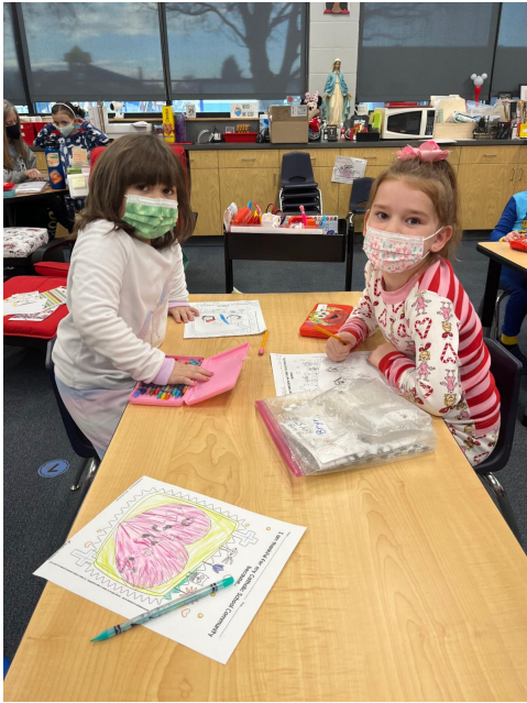
Monday was Pajama Day