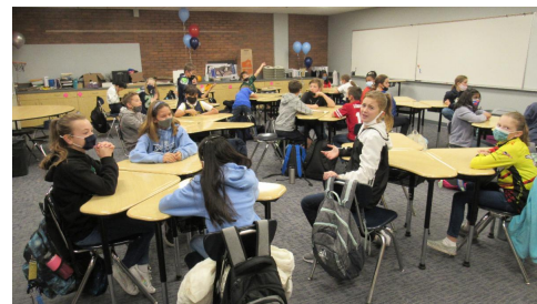
First day of class in the new classroom