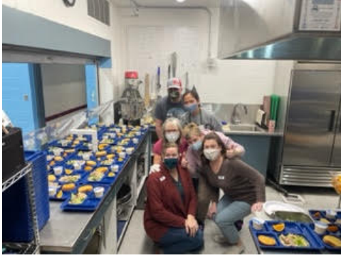
Our Lunchroom Volunteers as their future selves