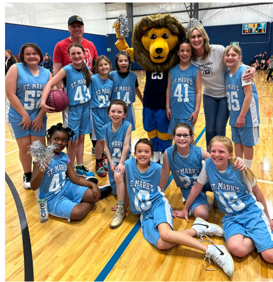
Our 4th grade girls WON THE CHAMPIONSHIP in the ICSI basketball tournament