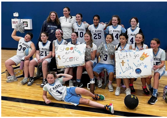
Our 5th/6th grade girls team TOOK 2ND PLACE in the ICSI basketball tournament