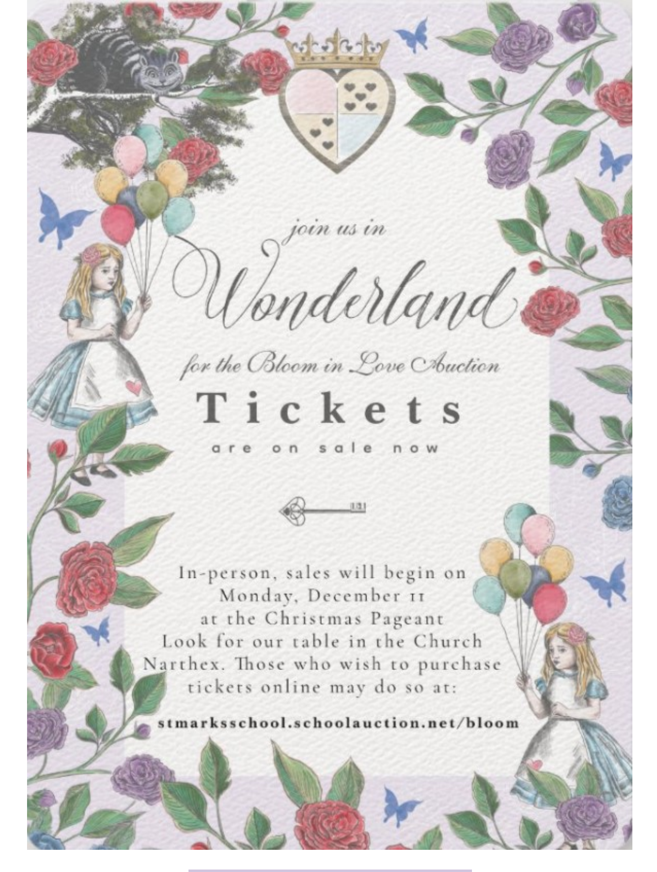
Click here to purchase your tickets