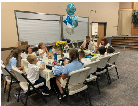
Mr. Cameron having lunch with the winners of the Summer Reading Program

Our guest on Monday is best known as the bestselling author of the book series A Dog's Purpose . By the end of this year, Bruce will have published 31 books, most of them about dogs. The film adaptation of A Dog's Purpose has become the most successful international live-action Dog Movie of all time. The film adaptations of his other bestselling novels 'A Dog's Way Home' and 'A Dog's Journey,' were released in 2019, and the fourth book in the series, 'A Dog's Promise,' was also released at the end of that year. Bruce's novels for younger readers have won awards and are taught in classrooms everywhere. Fans of his 8-book series 'Lilly To The Rescue' will be happy to hear there are 4 more on the way. On August 30th his latest Puppy Tale, 'Lacey's Story' was released, and in January he's releasing 'Love Clancy, Diary Of A Good Dog'. We welcomed Mr. W. Bruce Cameron!