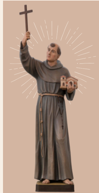
ST. JUNIPERO SERRA

Black dress, white scarf or head covering, carry a rosary or a few flowers.