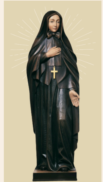
ST. FRANCES XAVIER CABRINI

Brown robe or an oversized t-shirt with a rope belt, sandals and a small wooden cross.