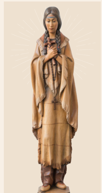
ST KATERI TEKAKWITHA

Brown shirt or tunic, tool belt or toy hammer/saw, wooden staff.