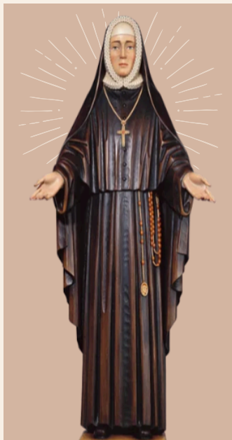
ST ROSE PHILLIPPINE DUCHESNE

Black dress, black scarf or veil, small cross or pocket watch.