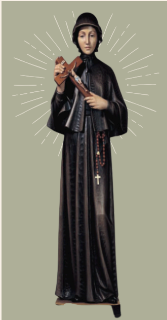
ST. ELIZABETH ANN SETON

Long dark dress, bonnet or shawl, and a book or rosary.