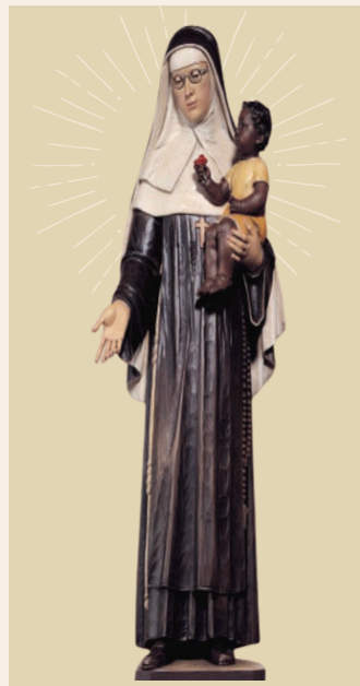
ST KATHERINE DREXEL

Dark dress with a shawl or veil, small cross, map or globe for her missionary work.