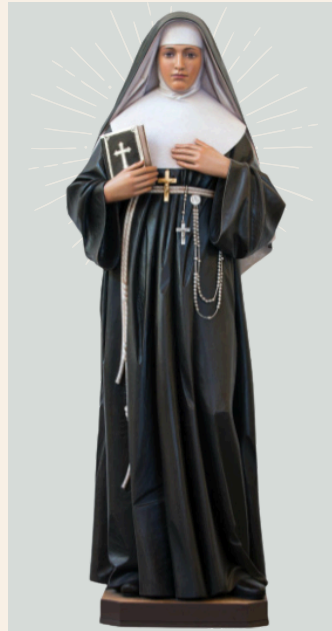
ST. MARIANNE COPE

Long dark dress, bonnet or shawl, and a book or rosary.