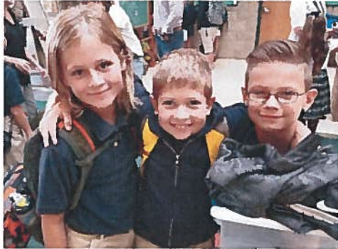
form new friendships

ALL ARE WELCOME TO EXPLORE A DYNAMIC CATHOLIC SCHOOL