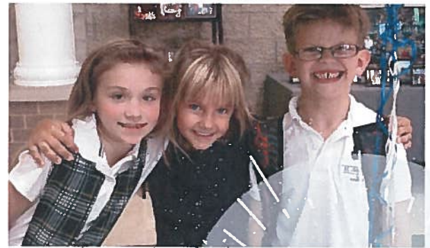
learn, laugh, love, and serve