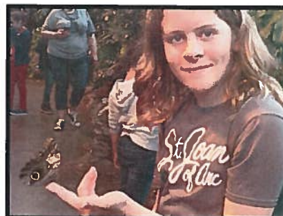
Milwaukee Public Museum