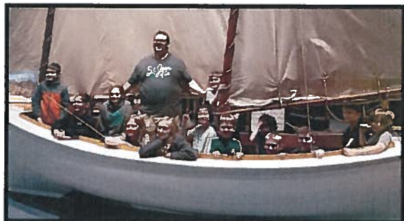
Wisconsin Maritime Museum