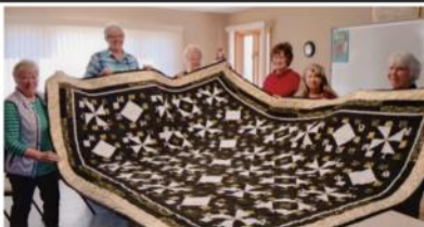
"2019 Golden Inspiration"