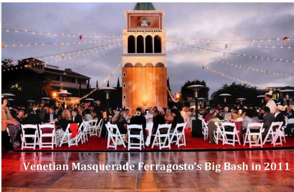
Venetian Masquerade Ferragosto's Big Bash in 2011