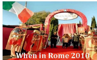
When in Rome 2010

For tickets and information: www.ferragostosd.org