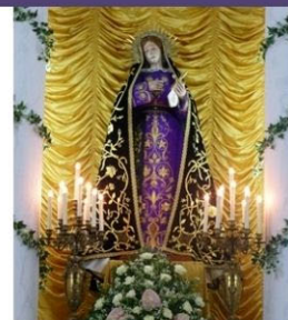
Above: The Maria SS Addolorata statue in Santa’ Elia church in Sicily.

1. The Prophecy of Simeon; 2. The Flight into Egypt; 3. The Loss of the Child Jesus in the Temple in Jerusalem; 4. Mary Meeting Jesus on the Via Dolorosa; 5. The Crucifixion; 6. The Piercing of the Side of Jesus with a Spear; and 7. The Burial of Jesus.