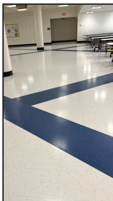
New flooring in Kemp