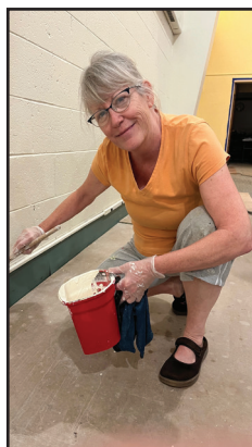
New paint inside church

K-5 students learn to share a quiet sign of peace during prayers.