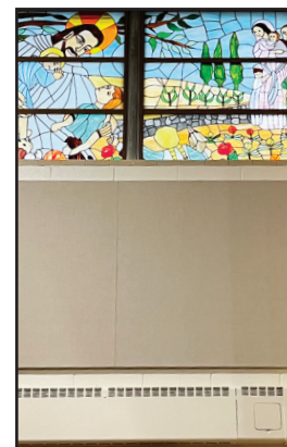
Sound panels in church