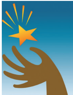
Rising Star logo

The tutors provide enrichment for some of our more advanced students. One of our 4th grade students who is receiving enrichment from one of our Rising Stars tutors said, "I think it is fun! We get to ask a lot of questions. I like it because we get to do all different kinds of extra and harder reading and math problems. There are only a few of us that go with the tutor at a time, so we get more attention