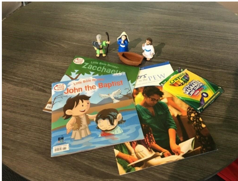
Coloring books, crayons, toys are in the toddler bags.

The Elizabeth Ministry Rose Bud Program is located in the northwest corner of the Gathering Space on a table and shelf.