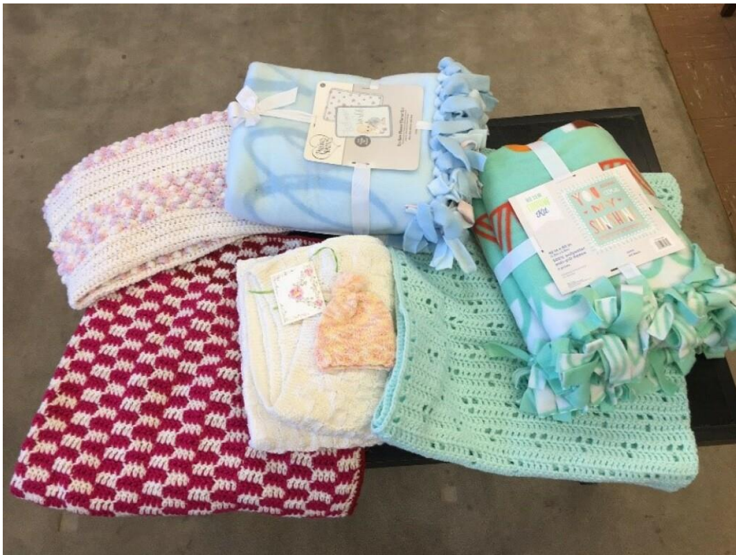
Donated baby blankets, some store-bought, some homemade.

Families with little children are welcome at St. Agnes, but we understand it is difficult to keep them occupied during Mass. The Elizabeth Ministry offers toddler bags for families to use during Mass.