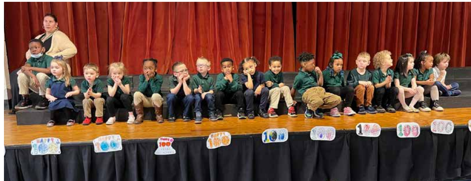
K-4 students lined up on stage to wait the the rest of the early grade classes to file in for their performance.