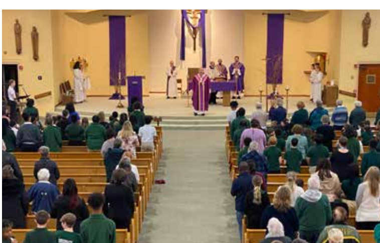
View from the choir loft during Mass