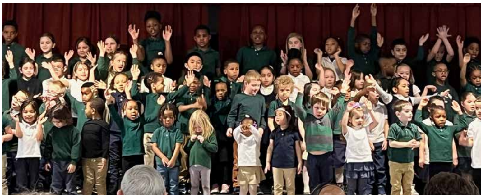
K-3 through 3rd students performed four of the songs that they've learned for their Wednesday morning prayer services.