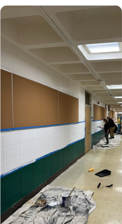
(Left) Red and yellow paint mark the area in the school hallway where the bulletin board was removed; (right) the new bulletin board was installed higher and the wall painted to make room for new hooks for the students.