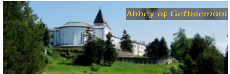
Abbey of Gethsemani

Our Latino Festival will be taking place on September 6th and 7th, and we need your help!! We are once again having a raffle booth and are requesting items to be donated for the booth. Donation ideas include exercise equipment/clothing, tools, kids' toys (outside toys, stuffed animals, gaming consoles, Legos), household items, tickets to sporting events or family outings, movie tickets and gift cards. We appreciate any and all donations and as always, thank you for your continued support.