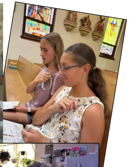
Divine Savior Catholic School students during Rosary Club (above right) and Curiosity Club (right).