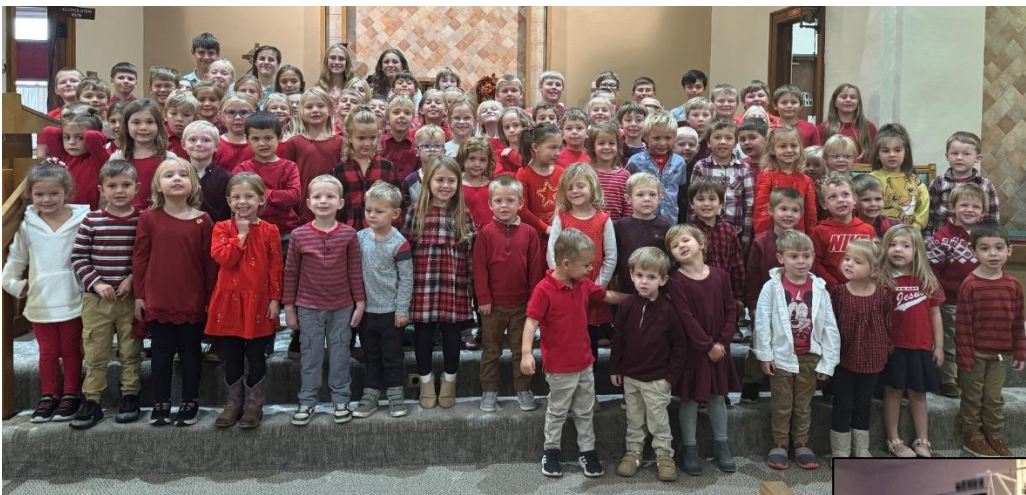
Divine Savior Catholic School Students during the week of the Red Ribbon Campaign against drugs (above).