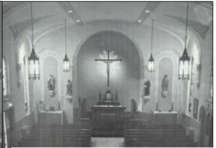
After the 1980 remodel

In 2015, a beautiful prayer garden was added to the grounds, in conjunction with a renovation at the former school building when two former classrooms were turned into a Community Room and the bathrooms were renovated.