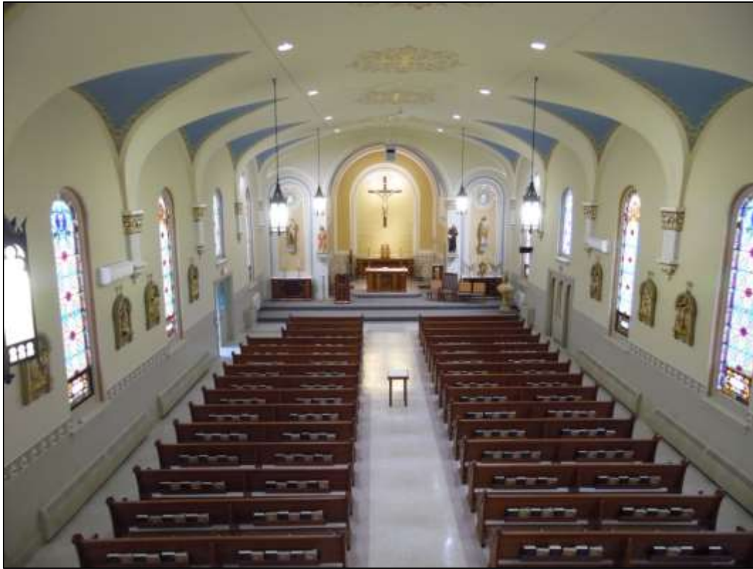
After the 2017-2018 renovation

From December 2017-April 2018, renovations were made to repair the cracks in the walls, refinish the pews, restore the statues and the Stations of the Cross, refinish the terrazzo flooring, install new carpeting, clean the stained-glass windows, restore the altars, and repaint the chapel interior using a new color scheme.