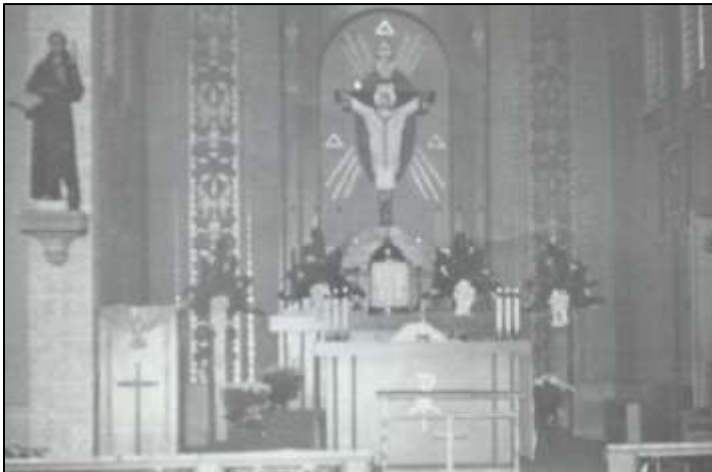
Prior to the 1980 remodel