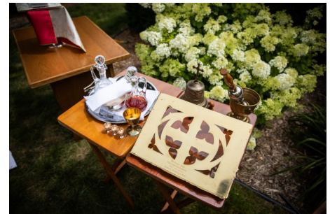
Mini Chalices were used for the family's First Communion.