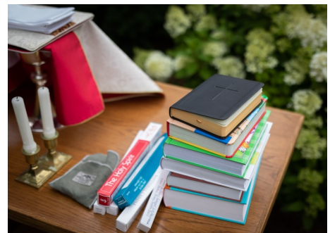
Baptismal Candles and gifts from the parish of Bibles and a Prayer Book wait for the service.

Piper checks out the fountain while the symbol of our faith presides.