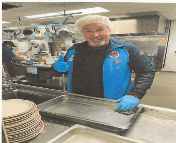
Dell taking on dishwasher duties