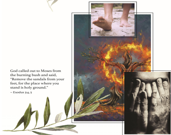
God called out to Moses from the burning bush and said, "Remove the sandals from your feet, for the place where you stand is holy ground." ~ Exodus 3:4, 5