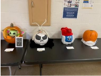
8 th Grade Pumpkins!

All Saints Day / VIP day was a fun day with many 8 th graders dressing as their favorite saint, playing bingo, and having family members join us for the day.