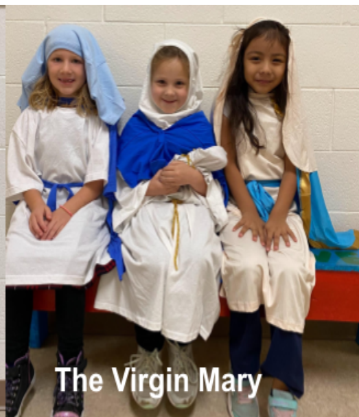
The Virgin Mary