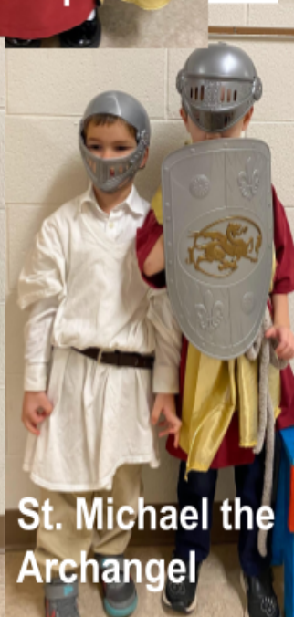
St. Michael the Archangel