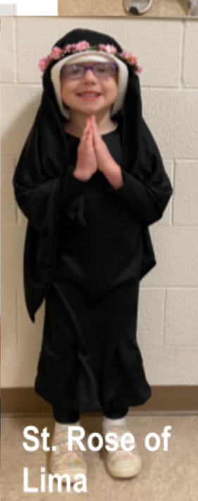
St. Rose of Lima