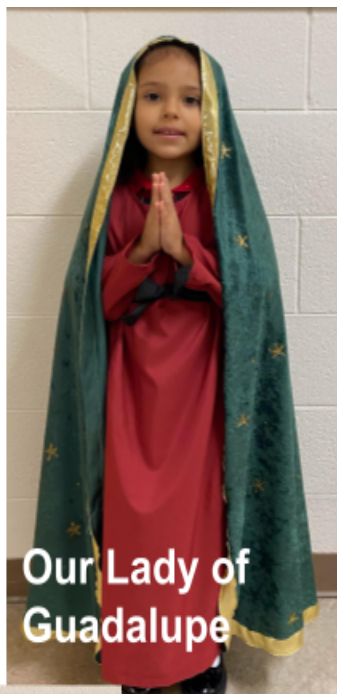
Our Lady of Guadalupe