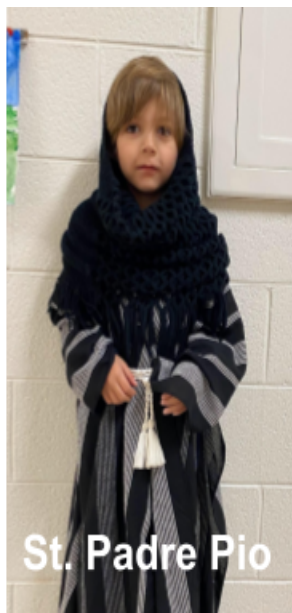
St. Padre Pio