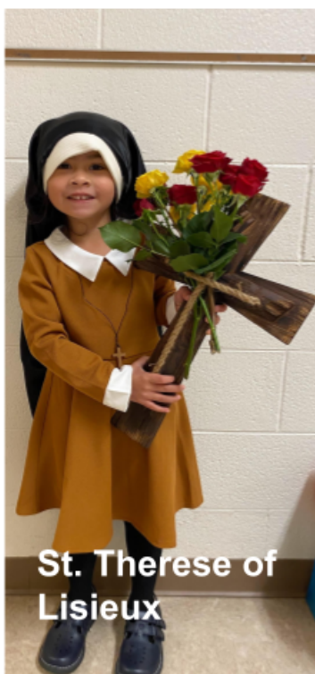
St. Therese of Lisieux