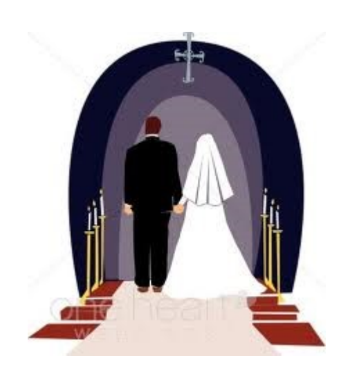
St. John the Evangelist Parish Greenfield, WI

To Help You Celebrate the Sacrament of Marriage