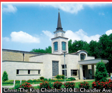
Christ The King Church, 3010 E. Chandler Ave.

Parish Center Office Location: 3010 E. Chandler Ave., Evansville, IN 47714 812-476-3061